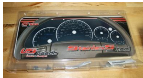
11. Open the US Speedo gauge face package.