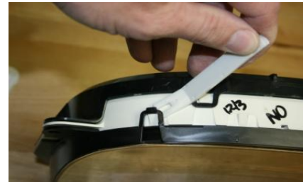
3. Use the needle tool to help remove the clear lens.