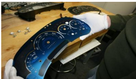
13. Put on the gloves before touching the stainless steel.