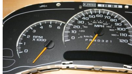
6. This will break the needle free from the shaft of the stepper motor.