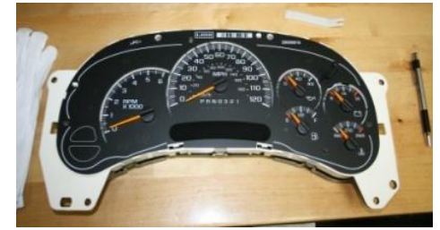
4. Cluster with the lens off.