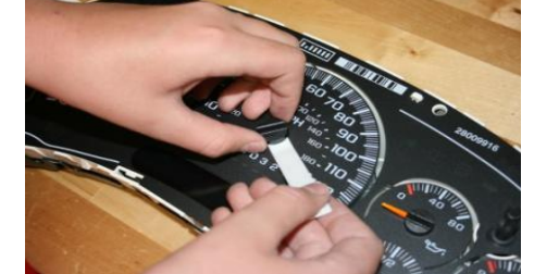
8. If the needles are hard to remove, twist and lift at the same time.