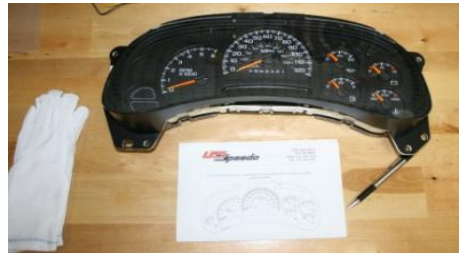
2. Make sure you have the needle positions marked. Should all be at low.