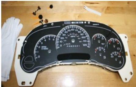
9. Remove all the needles.