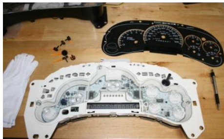
10. Remove the factory gauge face.