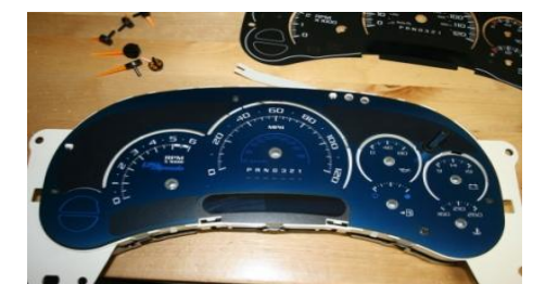
16. Place the New US Speedo Gauge Face in place.