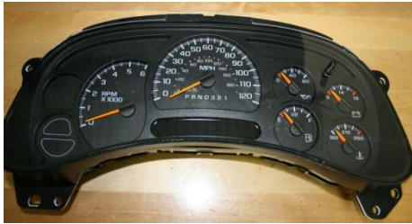
1. Bring cluster inside to a clean area to start the install.