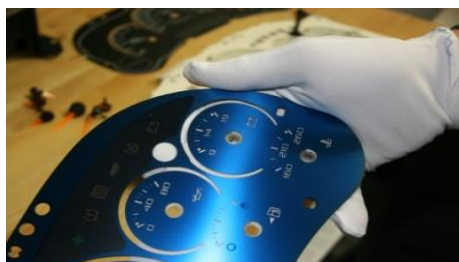
14. Only hold the gauge face by the edges.