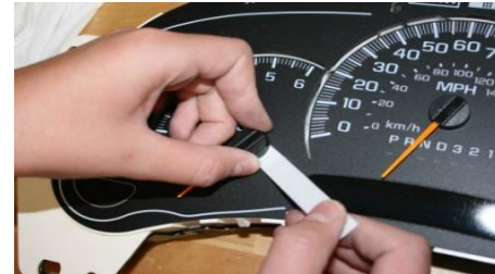
7. Use the needle tool to remove the needles.