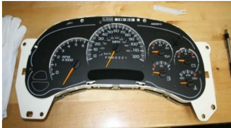
5. Twist each needle down past the low mark.