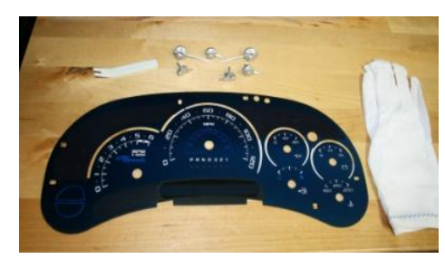
12. Only the SS and Aqua Kits come with gloves to protect from fingerprints.