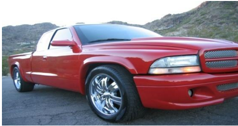
01-03 Dodge Dakota / Durango