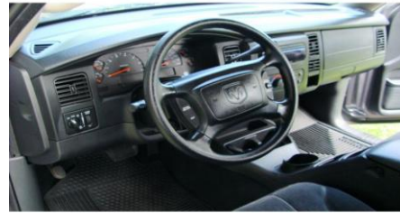
1. Use the diagram on the back to mark each needle.