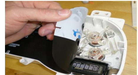
7. Remove the Black Stock gauge face.