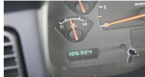
2. Mark each needle with the key on. Motor OFF. Remove cluster.