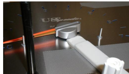
13. After you have the needles in place. Place the handle of the needle tool under the hub.