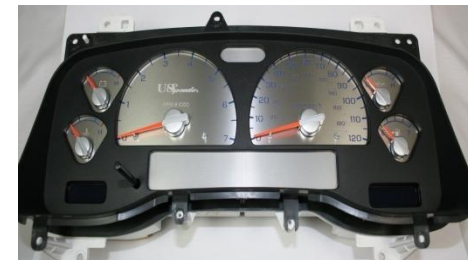
14. Push the needle hub down until it reach the lowest groove in the handle.