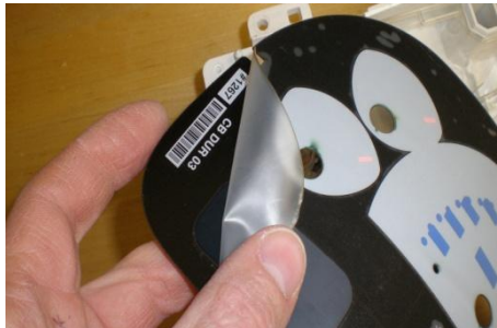
9. On the Back of the US Speedo gauge face is a plastic liner, remove.