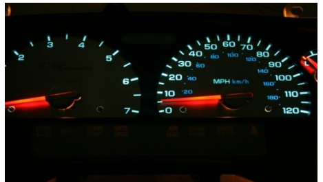
15. Check each needle position before installing the cluster. IF wrong, remove and start over.