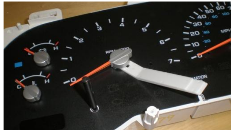
5. Use the needle tool to remove the needle.