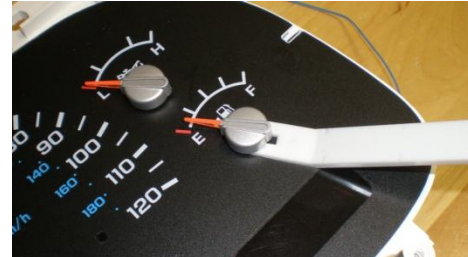
6. For the short needle, place the tool as shown to remove.