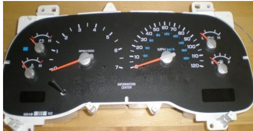
4. Remove the clear lens and retainer.