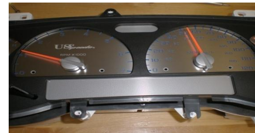
12. Put in the small needle stops.

Take Cluster back to Truck and Plug in. Then turn the key to accessory. Do NOT Start.