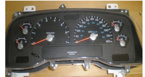
3. Take the cluster inside a clean area to start the install.