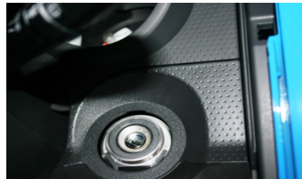
6. Remove the ring around the key hole.