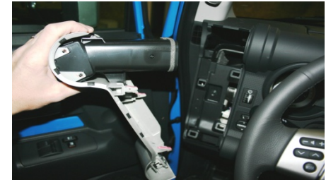
3. This vent is only held in with clips.