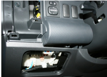
9. Pull the trim from in front of the speedometer out.