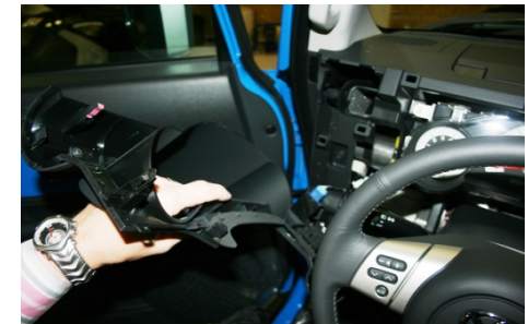
11. Unplug the wires on the left or just swing over to the left.