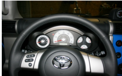
1. Mark the needle position of each needle.