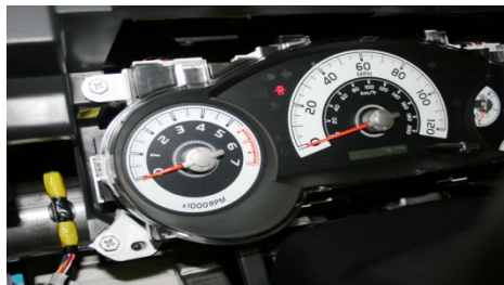
12. Remove the screws from the cluster.