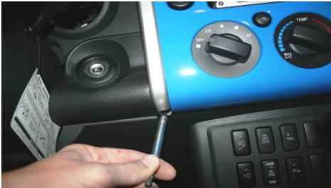
4. Right side. Remove the screw in the silver trim.