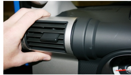
2. Pull on the left vent and remove.