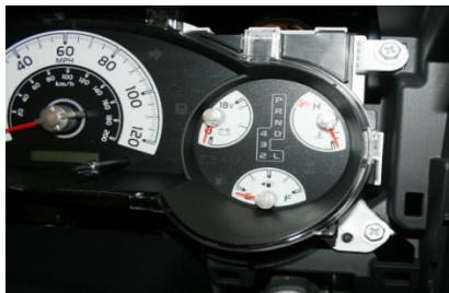
13. Remove screws and unplug.