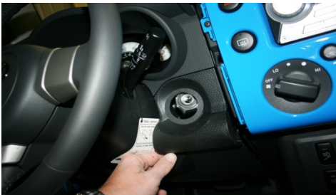
8. Just pull the trim down.