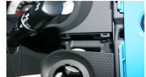
7. Pull the trim down around the lower steering area.