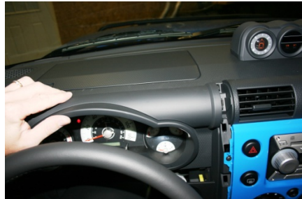
10. Just pull out towards the steering wheel.