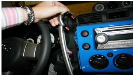
5. Pull the silver trim straight out.