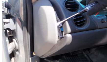
2. Remove the side trim cover with a flat screw driver.