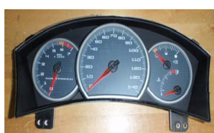
10. Take the speedo inside to complete the install.