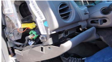
4. Pull out on the knee trim. It only snaps out.