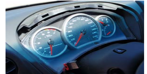
7. Remove the 4 screws holding the speedo in place.