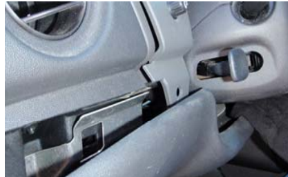
5. Reach behind the speedo trim and pull out.