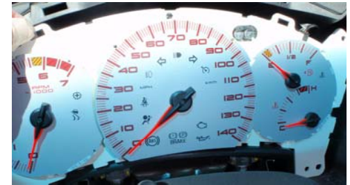
23. Plug the cluster in. Each needle must return back to the original mark.

IF NOT, unplug the cluster, remove the needle and start over. DO NOT MOVE the needle with the cluster plugged in.