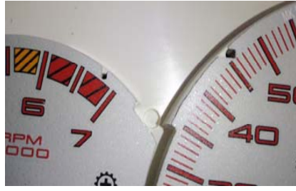
17. Align the gauge face as shown