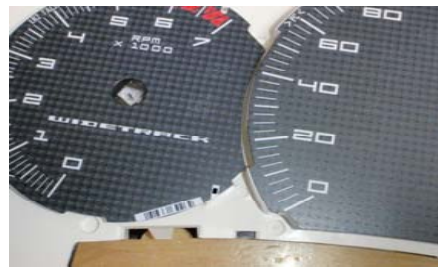
14. Remove each needle.