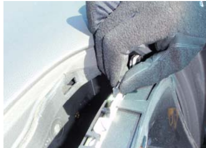
9. Unplug the speedo.