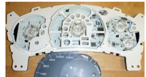
15. Remove the stock gauge face.