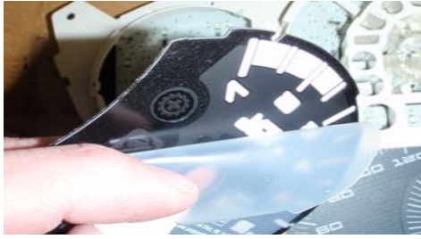
16. On the back of the US Speedo gauge face is a release liner. Remove and install gauge face.