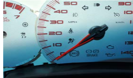
18. Take the speedo and needles back to the car and plug in.