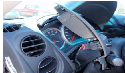
6. Remove the trim around the speedo.