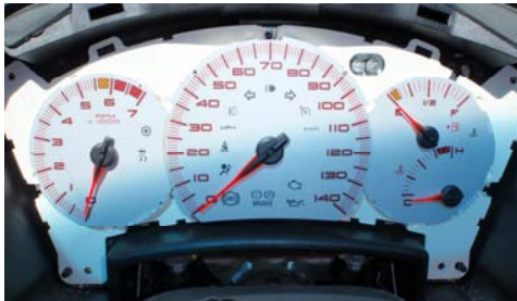
20. Use the handle of the needle tool under each hub to check for height.