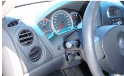
1. Start to remove the cluster...