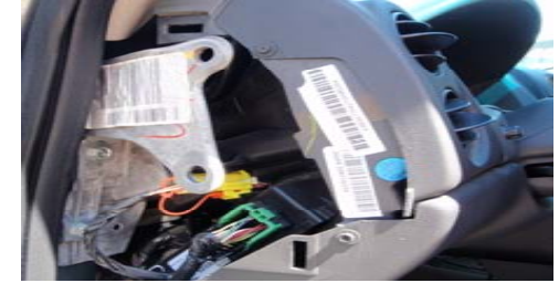
3. Remove the bottom trim screw.