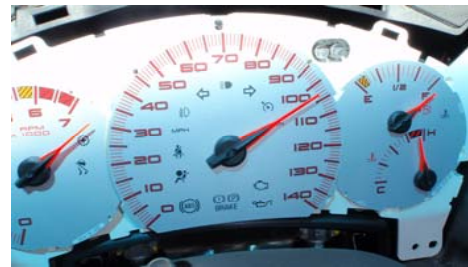
22. Move the needles up.