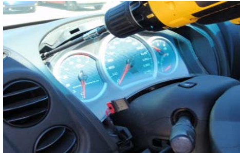
8. Remove the 4 screws.