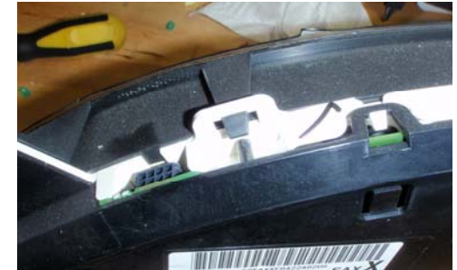
11. Remove the clear lens by releasing the clips.