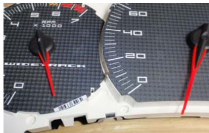
13. Twist each needle down past the low mark.