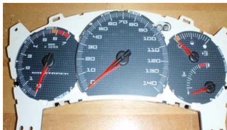
12. Mark where each needle is at. Before removing any needles.