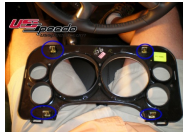
11. There are clips on each corner.