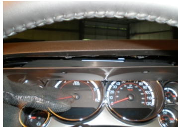
5. Start over the speedo to pull down the plastic.