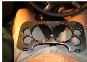
10. Brushed trim plate. Be careful not to scratch this!