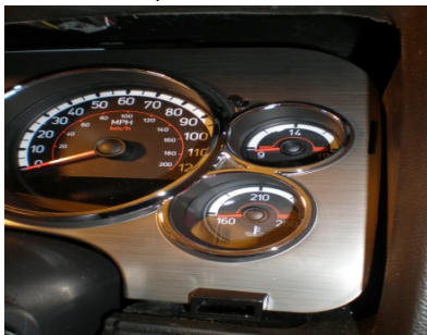
9. Remove the brushed trim plate. Start pulling on 1 corner at a time.