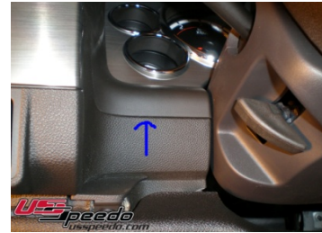
3. Pull out on the plastic. This is held in on with metal clips as shown.