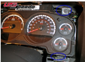
13. Remove the other two 7mm screws.