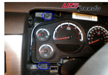
12. Remove the two 7mm screws.