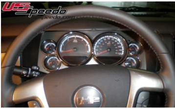
1. With the key OFF, Mark each needle setting on the diagram.