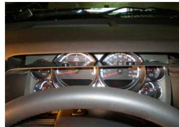
6. This trim is only set behind the dash. It just pulls out.