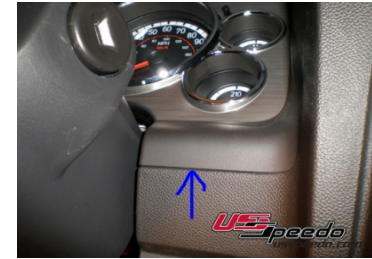
4. Use a flat screw driver to help if required.