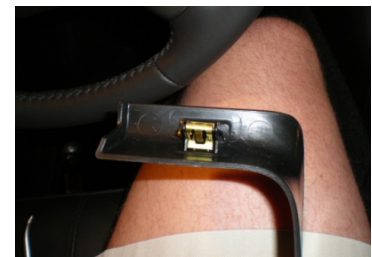
8. These are only metal clips that hold the trim in place.