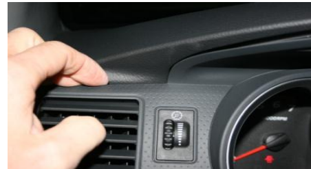
5. Pull out on the trim. It is held in with clips.