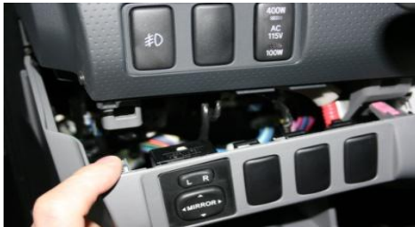
4. Pull straight out on the lower trim. There are some screws at the bottom to remove if you need to.