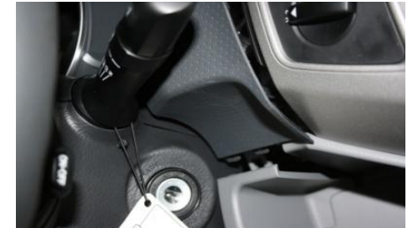
7. Make sure the lower trim is pulled out before the top trim.