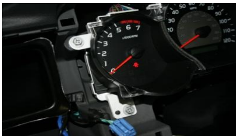
12. Remove the screws on each side of the cluster.