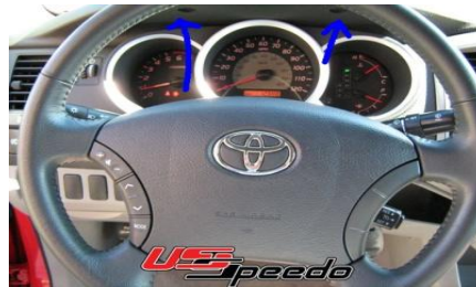
1. Mark the needle position with the key off.