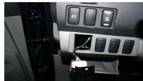
14. The lower switches can be pulled out if necessary when you install.