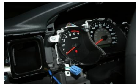
11. Slide the trim part to the left to remove.