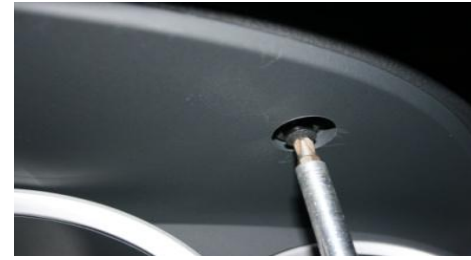
2. Phillips screw. It is plastic. You can not put any pressure on it to remove.