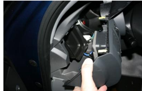
9. Unplug the switches.