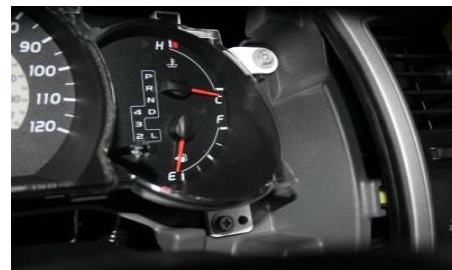
13. Remove the screws.