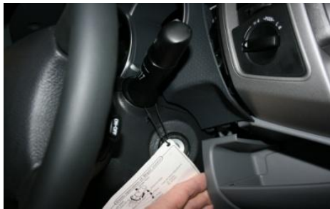
8. All this trim is held in with only clips.