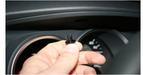
3. The screw is held in with this plastic clip. Remove.