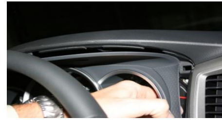
6. Continue pulling all around the trim.