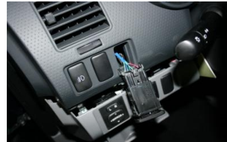
10. You can push the switches thru the front to unplug if needed.