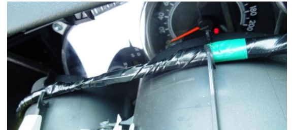
9. Remove the wires over the top trim.