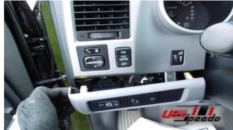
2. Pull on the left trim. Held in with only clips.