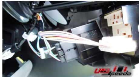
6. Remove the wires by pressing in the tabs and releasing from the socket.