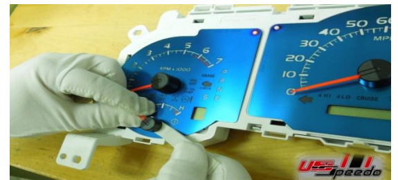
17. Replace the needles to the exact spot as the pics you just took.