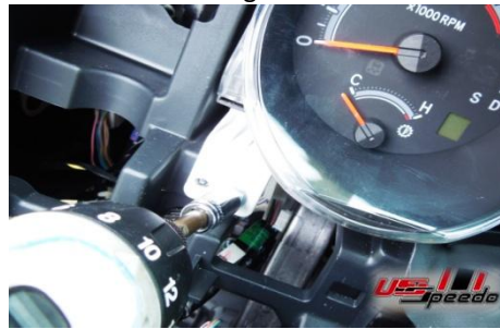
12. Remove the screws and unplug the cluster.