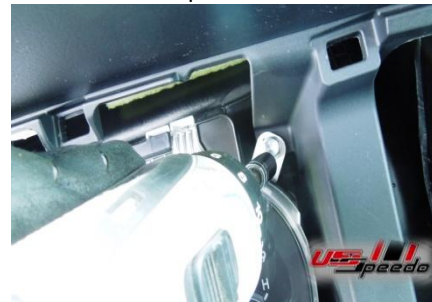
11. Remove the 4- 7mm screws holding cluster in.