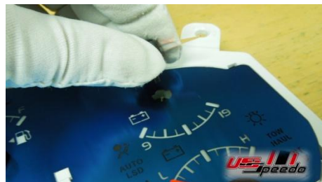
16. Take the cluster back to the car and reset the needles with the key off.