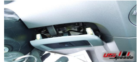
3. Pull on the right trim. Held in with clips.