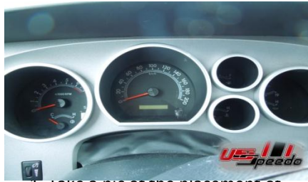
1. Take a pic or the placement of each of the needles with the key OFF