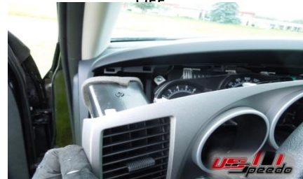
5. Continue to pull the trim in front of the speedometer.