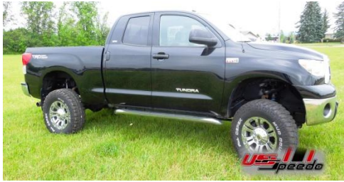
2007-2012 Toyota Tundra SR5