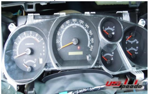
10. Make sure to mark or picture each needle location with key off.