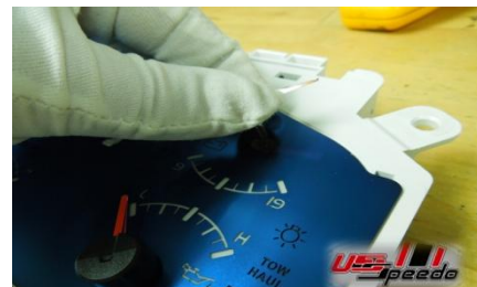
15. Place the new gauge faces in place. Use supplied gloves.