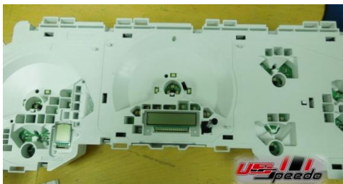
14. Remove the needles and stock gauge faces