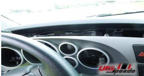
4. Pull the trim in front of the speedometer.